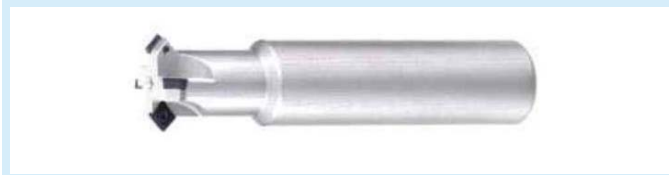
CDR 45°高速內外倒角刀 45°High speed inside and Outside chamfering cutter