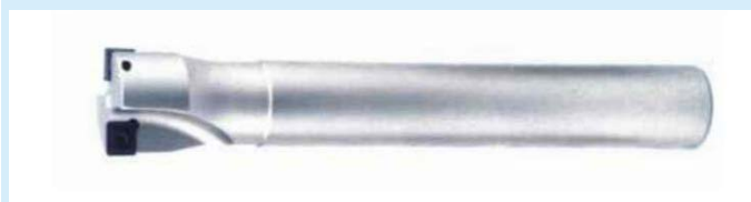
STM 高速T型刀 High speed t type cutter