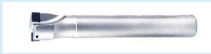
SRB 高速粗搪刀 High speed shell type milling cutter