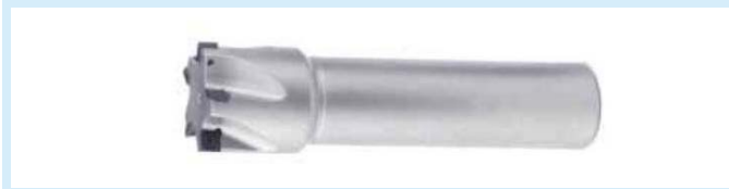
SEM 直角高速銑刀 Shoulder cutting high speed end mill