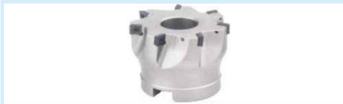
SEC 直角高速殼型銑刀 Shoulder cutting high speed shell type milling cutter