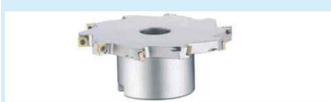
DFC 高速殼型側銑三面刀 High speed shell type side milling cutter