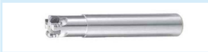
ASR 直柄高速進給銑刀 Straight shank high feed mill