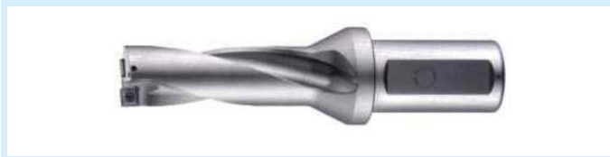
DDR 快速鑽頭 High speed drill